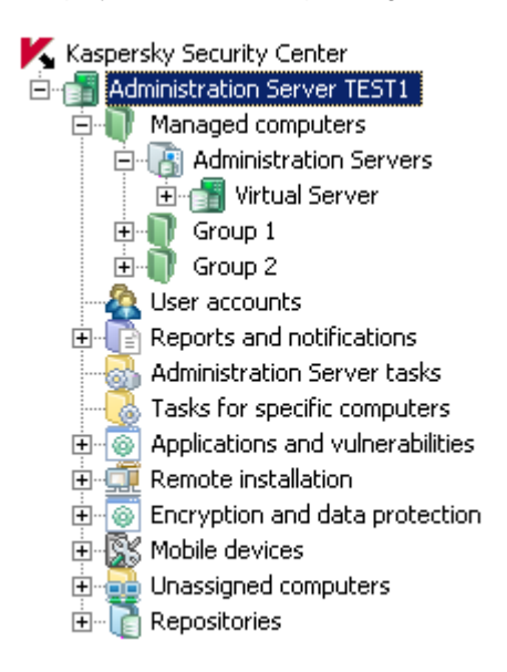
Figure 2. Viewing administration groups hierarchy

Identically to the Managed computers group, each created group initially contains the Administration Servers folder only, which is empty, intended to handle slave Administration Servers of this group. Information about policies, tasks of this group, and computers included is displayed on the corresponding tabs in the workspace of this group.